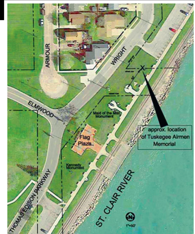
Proposed Location of Tuskegee Airmen Memorial

Diving With a Purpose www.divingwithapurpose.org