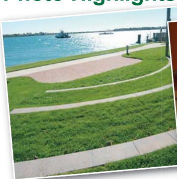
The new Marine City Amphitheater.