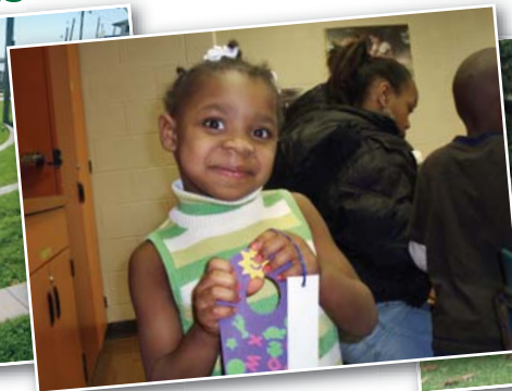
A happy face from the Family Read Night at Cleveland Elementary.