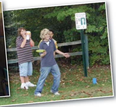
Holland Woods Middle School students enjoy their new Disc Golf Course, funded by the Youth Advisory Council.